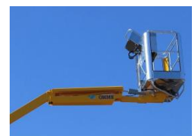
Fly jib (option)