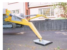
Easy set up